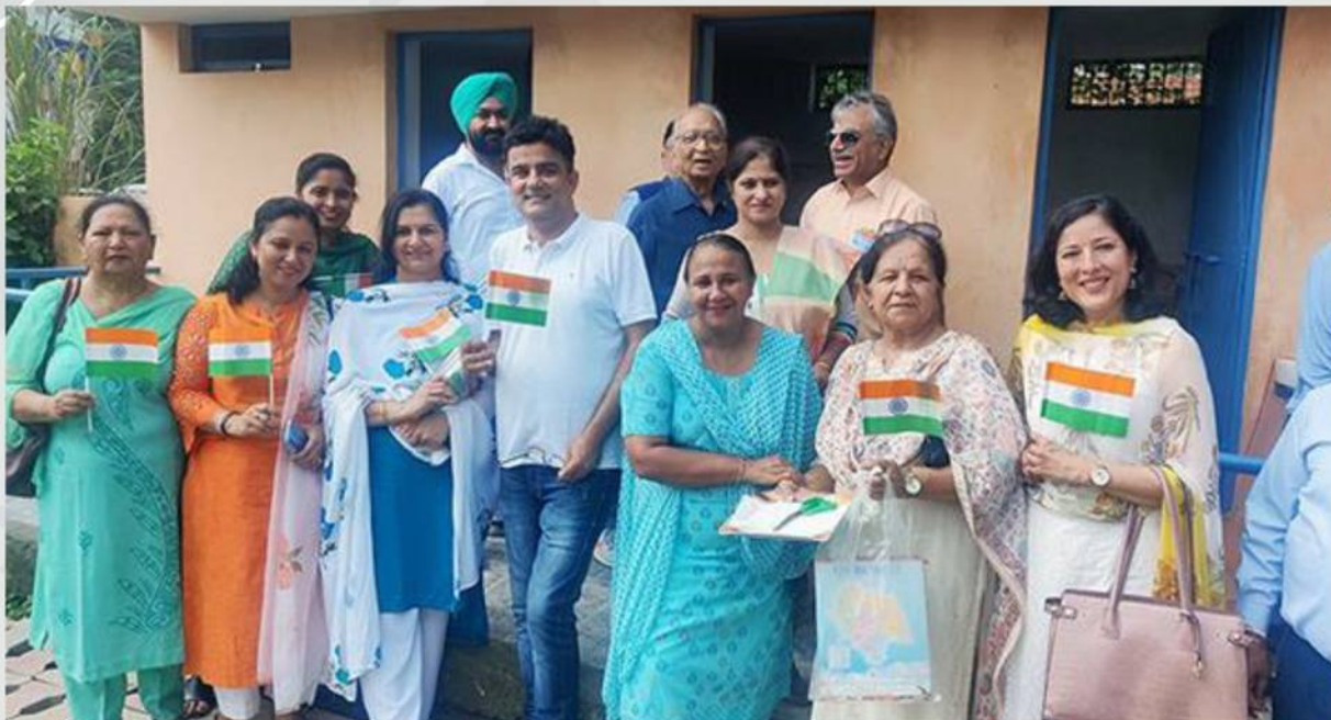
Members of the Rotary Club of Chandigarh Midtown pose in front of the new bathrooms they helped build at Singhpura School on the outskirts of town.